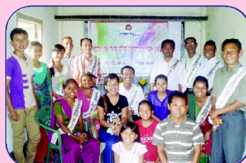
Training Programme of above Hozain Level Patharjhoda, India