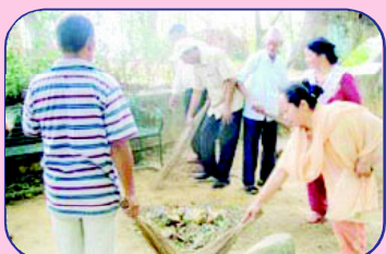
Cleanliness Programme, Dharan