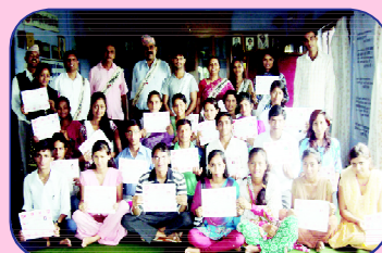
On completion of MC Training, Tikapur