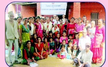
Interaction Programme of Reiyukai, Panchkhal