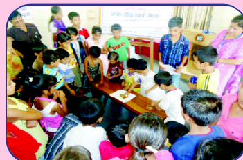
Myoichikai Gathering, Nepalgunj