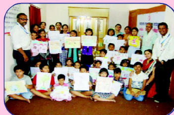
Drawing Competition, Bilaspur, India