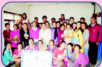
Candle Preparation Training, Illam.