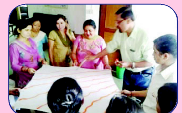
Fabric Painting Training, Dhobidhara

What is your opinion about TODAY? We expect your valuable suggestions regarding the subjects to be covered up in this bulletin.