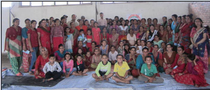
Women's Gathering, Eurasia Reiyukai 25th Branch, Kavre