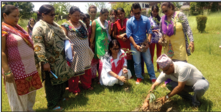
Tree Plantation Programme, Eurasia Reiyukai 17th Branch, Sidharthnagar

(Extracted and compiled from the WHO website and different magazines).