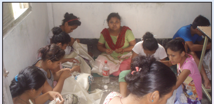
Traditional Scarf Making Training, Eurasia Reiyukai 21th Branch, Siliguri