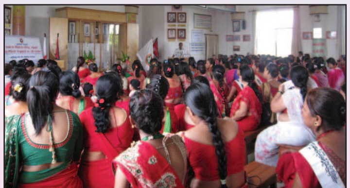
Monthly Gathering of 18th August 2014 and An Special Programme on Teej Festival, Eurasia Reiyukai 28th Branch, Bhadrapur