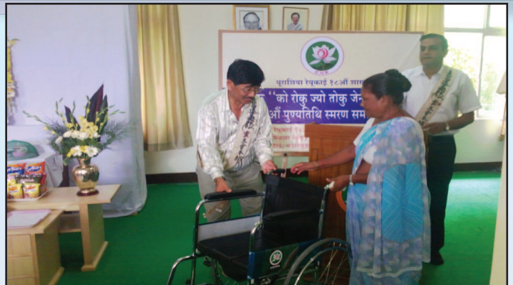
Wheel Chair Distribution Programme, Eurasia Reiyukai 18th Branch, Kalimpong