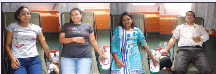
Blood Donation Programme, Society Development Centre, Sanepa