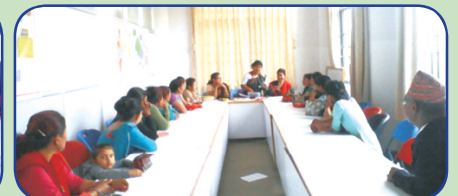
Handicraft Training, Bhadrapur, 28th Branch