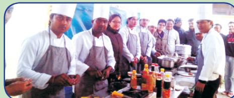
Cooking Training, Siddharthanagar, 17th Branch