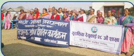
Free Eye Check up Camp, Haldibari, 28th Branch